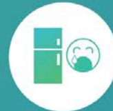
Distractions within the employee's home