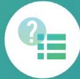
Limited or lack of access to necessary information