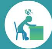
Lack of motivation

Managers should acknowledge these challenges, but can also take steps to address obstacles their team members may encounter. This section offers considerations for addressing challenges your employees may face in the remote environment.