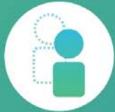
Lack of face-to-face interaction

Remote employees face unique challenges. While numerous studies show that remote employees can achieve levels of productivity that are the same as or higher than their non-remote peers, this isn't without obstacles. According to the Harvard Business Review, challenges remote employees often encounter include: